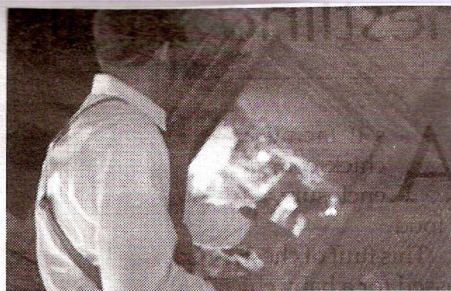
Roasting artisan coffees by hand.