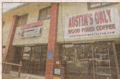
At Summermoon, the interior is casual and warm with wood and stone, right, and the lattes have 'moon milk.'