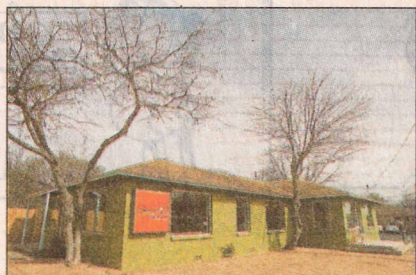
At Clementine's, make a lunch of the tomato, basil and mozzarella panino and macchiato coffee, below right.